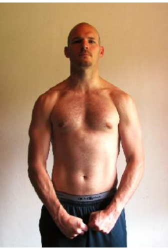
[After completing Phase 3]