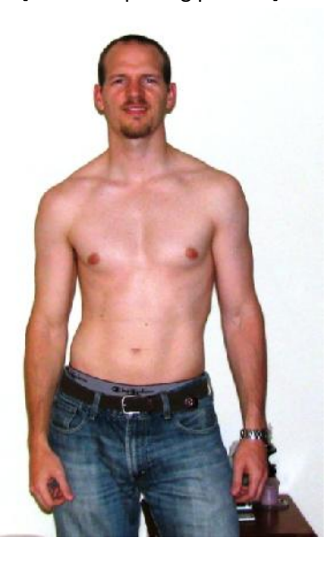
[After completing phase 1]